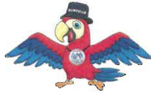
Term 2 Week 8

The PBS4L draw winners for Term 2 Week 8 & Week 9 are: